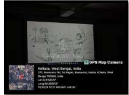
Snippet from screening from Malgudi Days